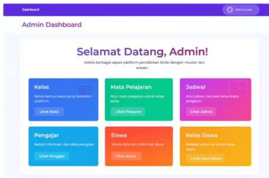
Figure 3 Admin Dashboard

The implementation stage produced a fully functional prototype of the LKP Aneka Prima Kayuagung information system. This prototype integrates several essential features designed to support academic and administrative activities, including modules for kelas (class), mata pelajaran (subject), jadwal (schedule), pengajar (teacher), siswa (student), and kelas siswa (student class). Each module is connected to ensure seamless data flow and consistent information management across the system. These features are illustrated in Figure 3.